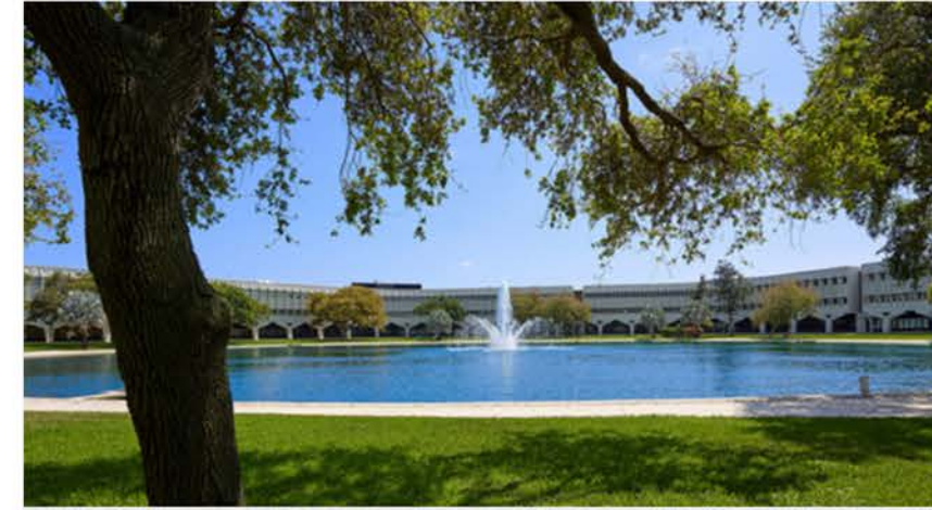
BOCA RATON INNOVATION CAMPUS (BRIC) Boca Raton