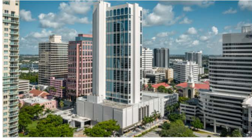
ONE FINANCIAL PLAZA Fort Lauderdale