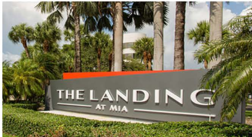
THE LANDING AT MIA Doral