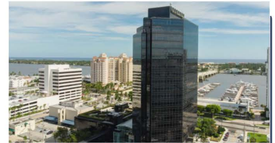
NORTHBRIDGE CENTRE West Palm Beach