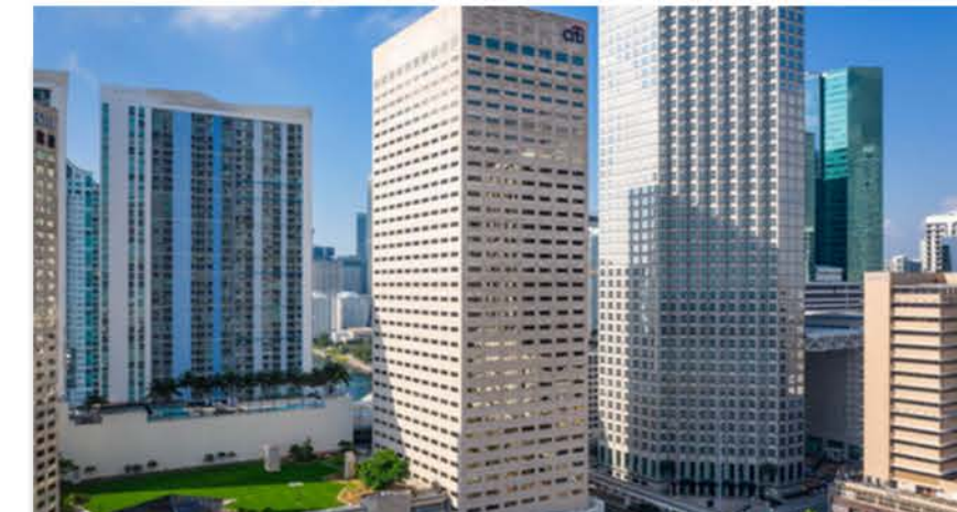
CITIGROUP CENTER Miami