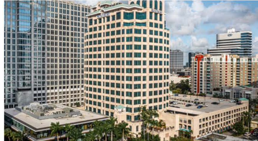
LAS OLAS SQUARE Fort Lauderdale